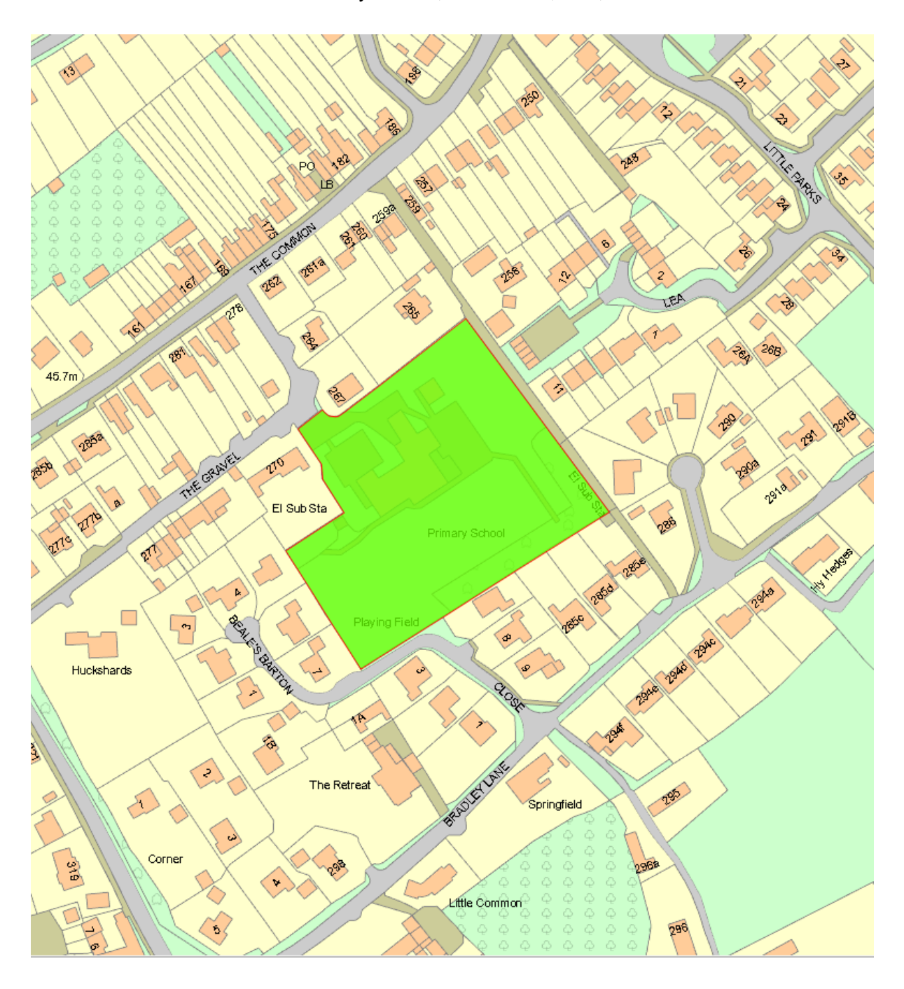
Item 2 - 14/12030/DP3 - Holt Primary School, The Gravel, Holt, BA14 6RA