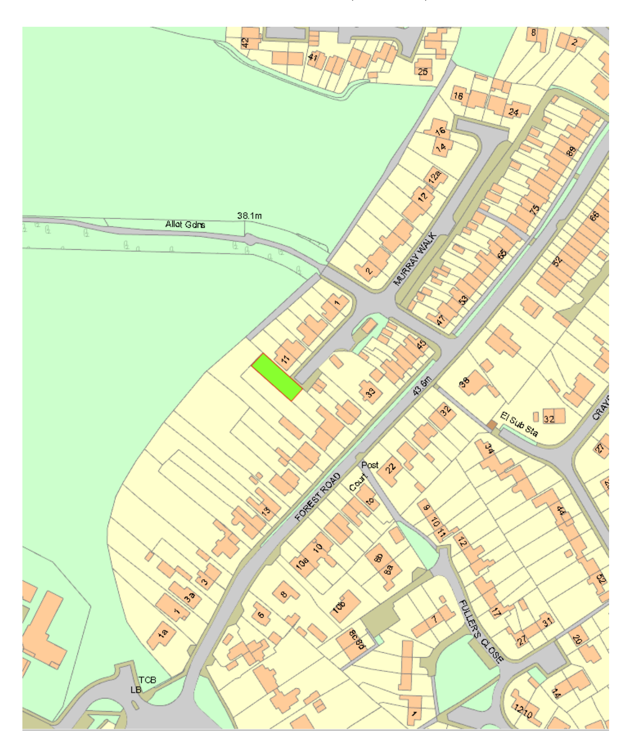
Item 3 - 14/11269/REM - Garden of 27 Forest Road, Melksham, SN12 7AA